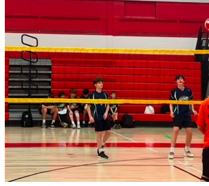
Intermeidate Boys Volleyball team in action Third Place Finish