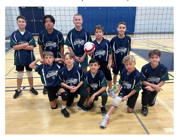
Junior Boys Triple Ball 2nd Place Finish